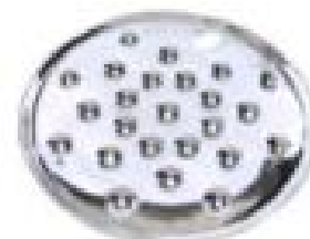
Brass or chrome drip tray cover