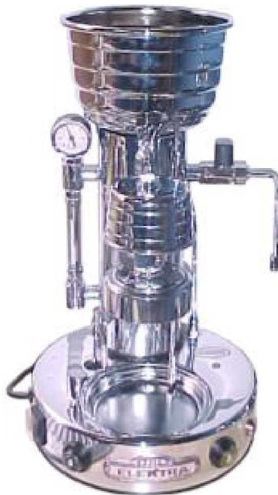
Micro casa semiautomatica espresso coffee machine