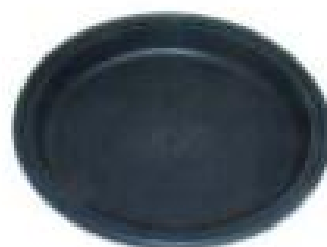
Plastic drip tray