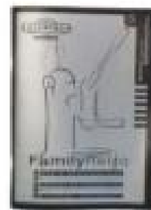
Instruction manual with guarantee card