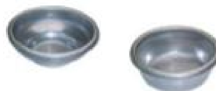
Single and double filter baskets